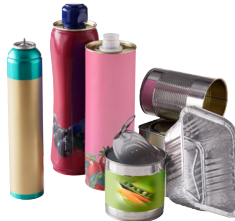
METAL Tins, trays, aerosols