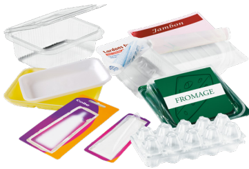
PLASTIC AND POLYSTYRENE TRAYS