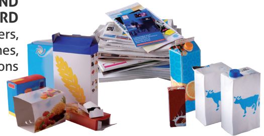
PAPER AND CARDBOARD Newspapers, magazines, boxes, cartons